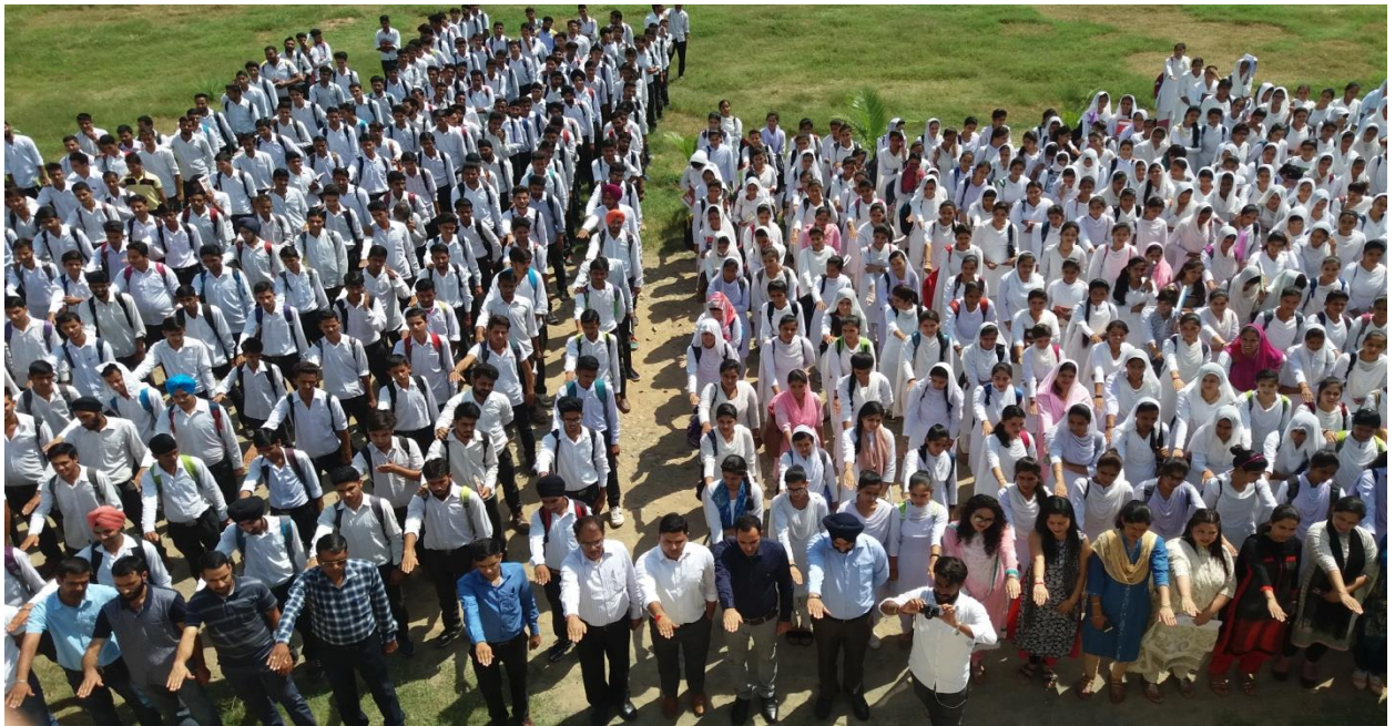
Students and the Staff of the College taking Sanitation Pledge

A sanitation campaign under 'Swacheta Hi Seva' mission launched today in the college with a pledge taken by the students and staff of the college to devote 100 hours per year to carry sanitation works and also to create awareness for cleanliness among all the stakeholders. The sanitation campaign is scheduled to be take place w.e.f. 15-9-2017 to 2-10-17 under the college notified schedule.